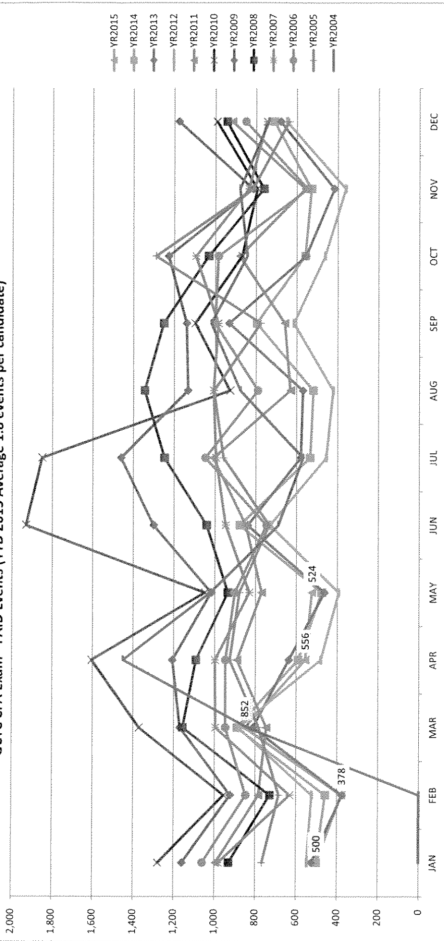
GCTC CPA Exam - PAID Events (YTD 2015 Average 1.8 events per candidate)